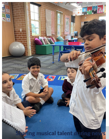
Sharing musical talent during news