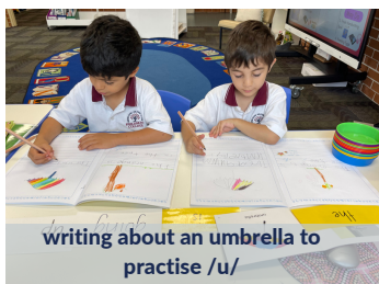
writing about an umbrella to practise /u/

Kindergarten practised using their sight words and taught sounds to write sentences and Stage 1 learnt more about the structure of a narrative and wrote two of their very own narratives with some support from the teacher.