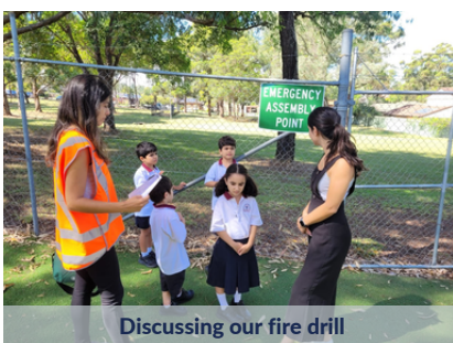
Discussing our fire drill