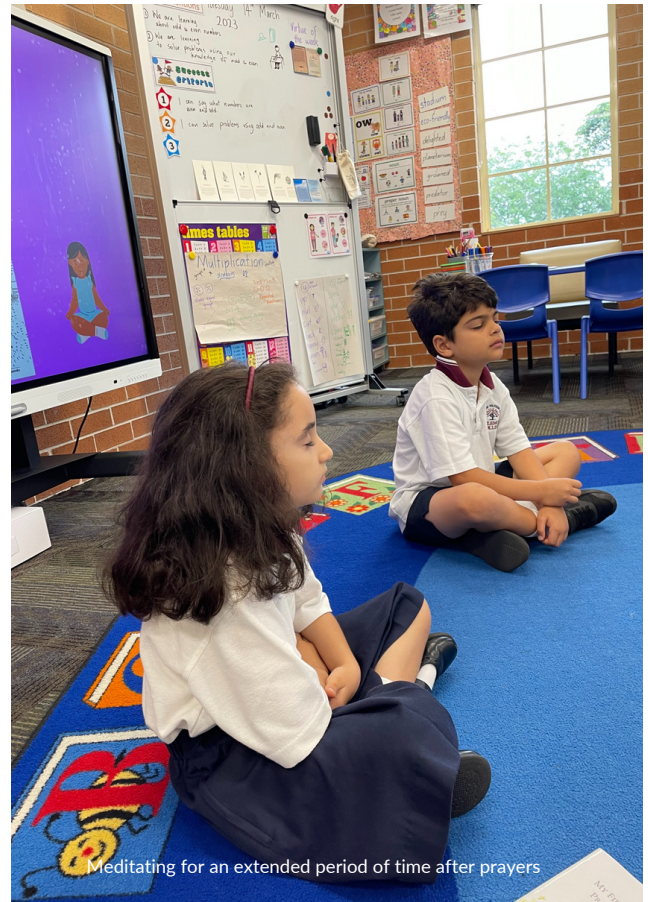
Meditating for an extended period of time after prayers

Our fire drill went well today, and the children (and adults) practiced responsibility and orderliness as they made their way to the Emergency Assembly Point. Well done everyone.