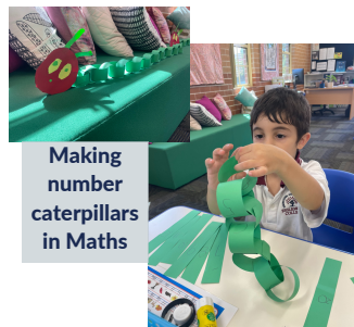
Making number caterpillars in Maths

In PDH we learnt about it being okay to make mistakes and how we can turn them into something beautiful if we try. Reading the book 'Beautiful Oops' was a big hit and reinforced this concept with the students.