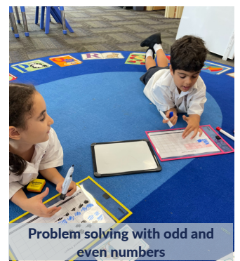
Problem solving with odd and even numbers