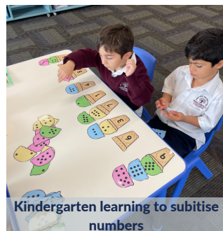
Kindergarten learning to subitise numbers