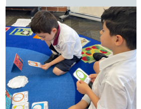
Practising reading o'clock time on digital and analog clocks