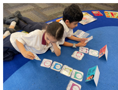
Practising reading analog and digital clock faces to say whether they match or don't match

Have a safe and happy holiday! We look forward to welcoming all students back to school on Tuesday the 10th of October.