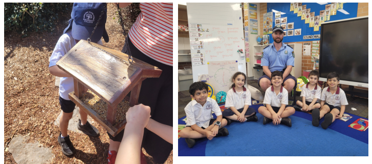
Pyjama Day, Preschool Visit and Police Officer Visit

Looking ahead, we look forward to welcoming everyone back to school on Tuesday, 10th October, rejuvenated and eager for another term of enriching learning experiences, hearty laughter, and an abundance of fun. Remember to come ready for our first ever school photos on day 2!