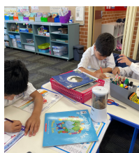
Reading quality literature

The students have been reading more for enjoyment this week, both fiction and non-fiction texts. This has led to a number of interesting discussions amongst students and developed a deeper love for reading.