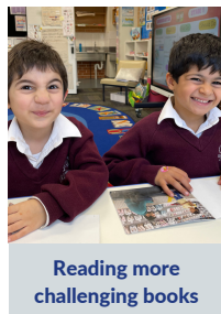
Reading more challenging books

A new app (EPIC school) for reading has been a highlight for all of the children this week. They love exploring the informative texts, learning new and interesting facts, as well as viewing the diagrams and short videos that accompany the texts.