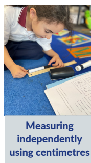
Measuring independently using centimetres