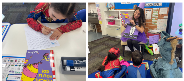
Exploring new literature and celebrating books for Book Week