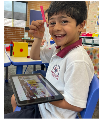
Following a procedure to create craft creatures, learning about justice through sport, measuring length, dance and reading for enjoyment