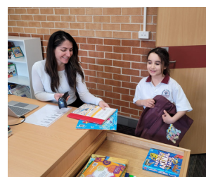
Borrowing new books at the library