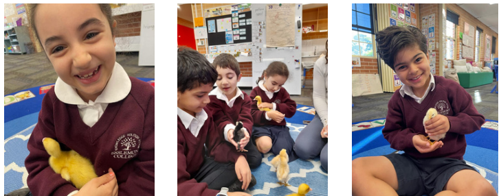
Saying goodbye to our chicks and ducklings after 2 weeks with them