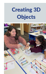
Creating 3D Objects