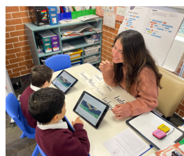
Reading new books using interactive devices and building word banks

Stage 1 have been deepening their knowledge of sentence structure - understanding that a sentence not only needs a capital letter, full stop and finger spaces, but also a subject, verb and object. They have also been working hard to learn the two phonemes for 'u', as well as consolidating other phonemes and digraphs.