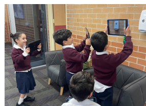
3D Object hunt